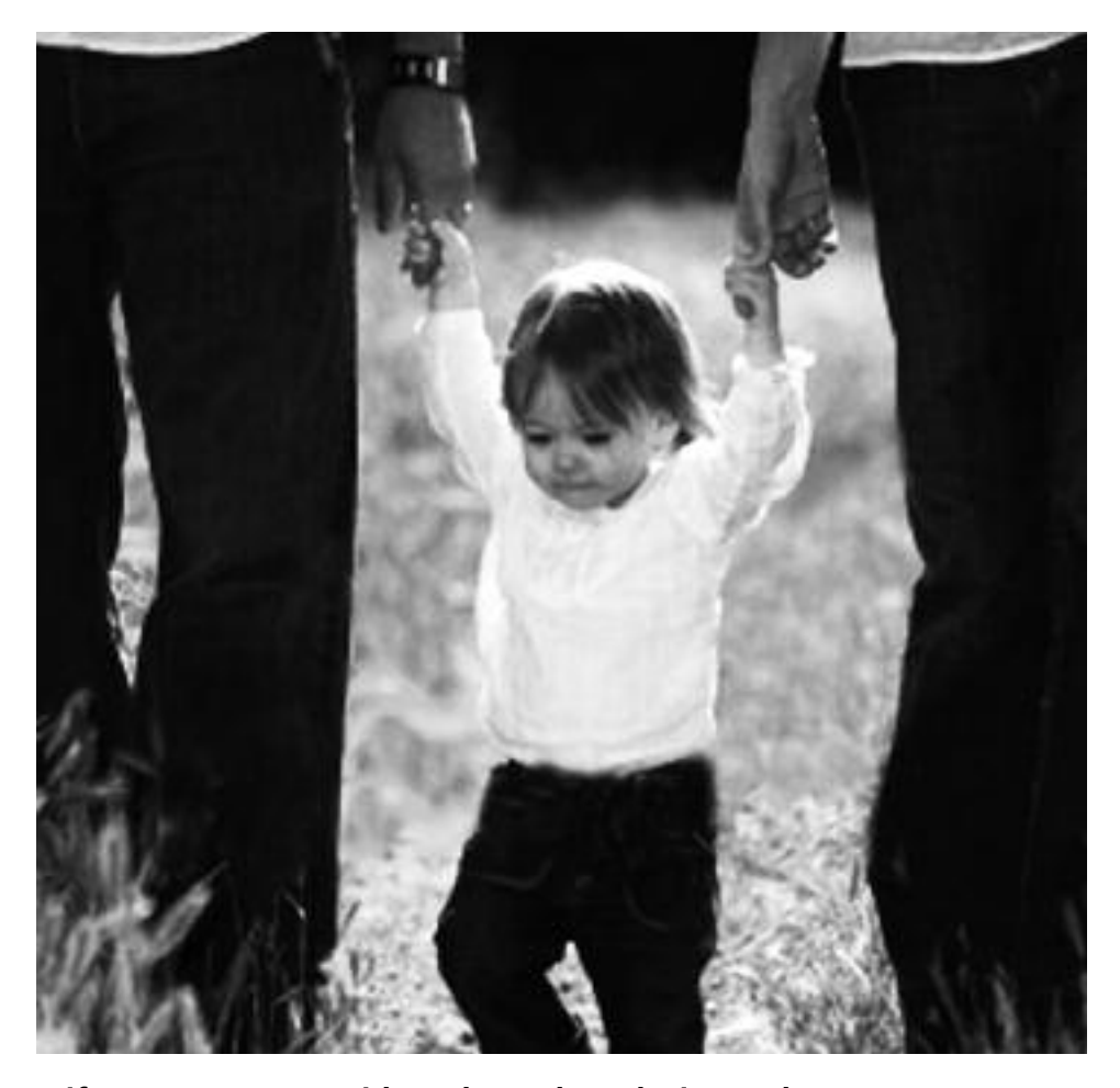
Life Insurance Accidental Death and Dismemberment Insurance Government Death Benefits Medical and Dental Benefits