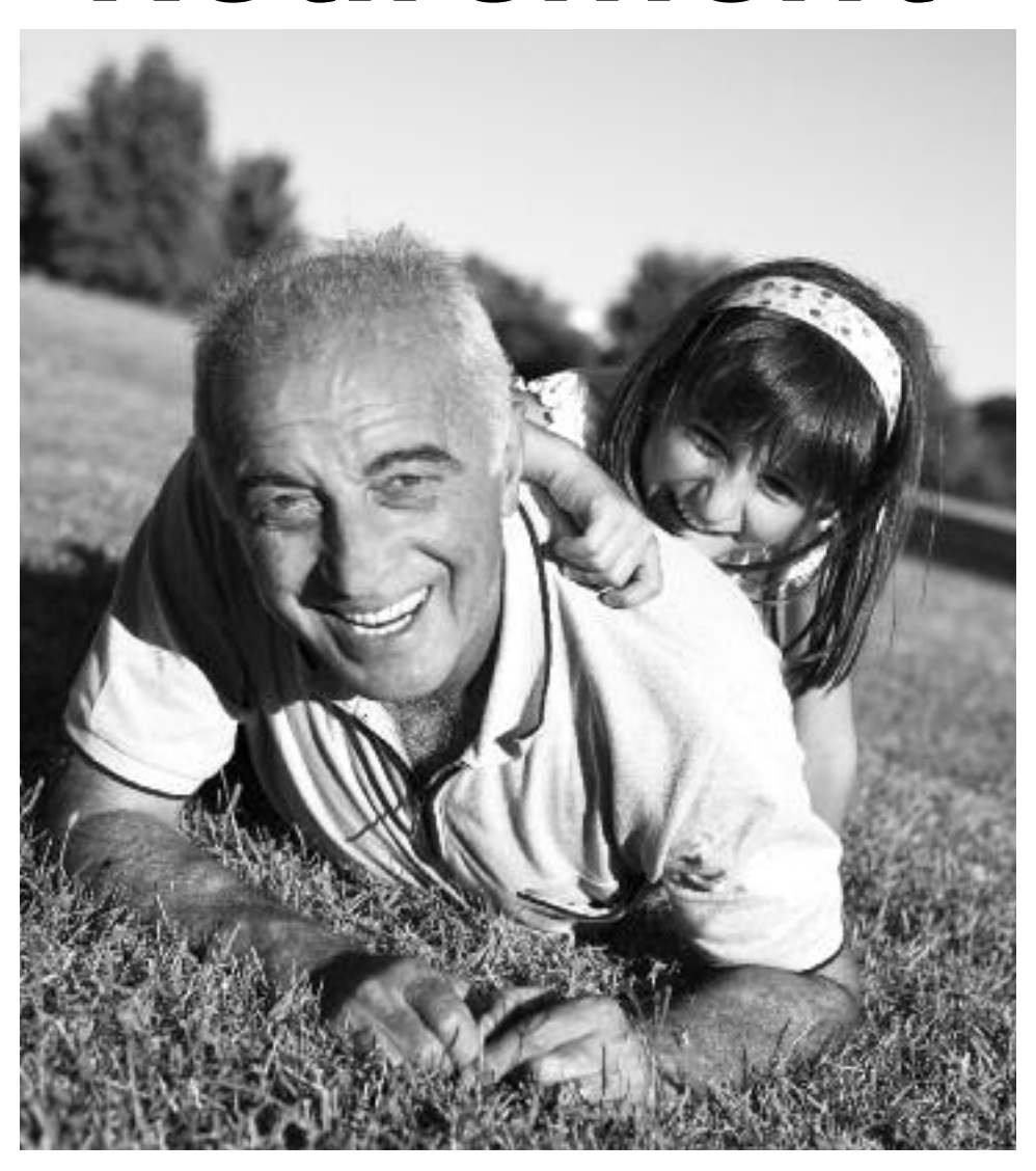
Company Pension Plan Retirement Savings Plan (RSP) Government Pension Benefits