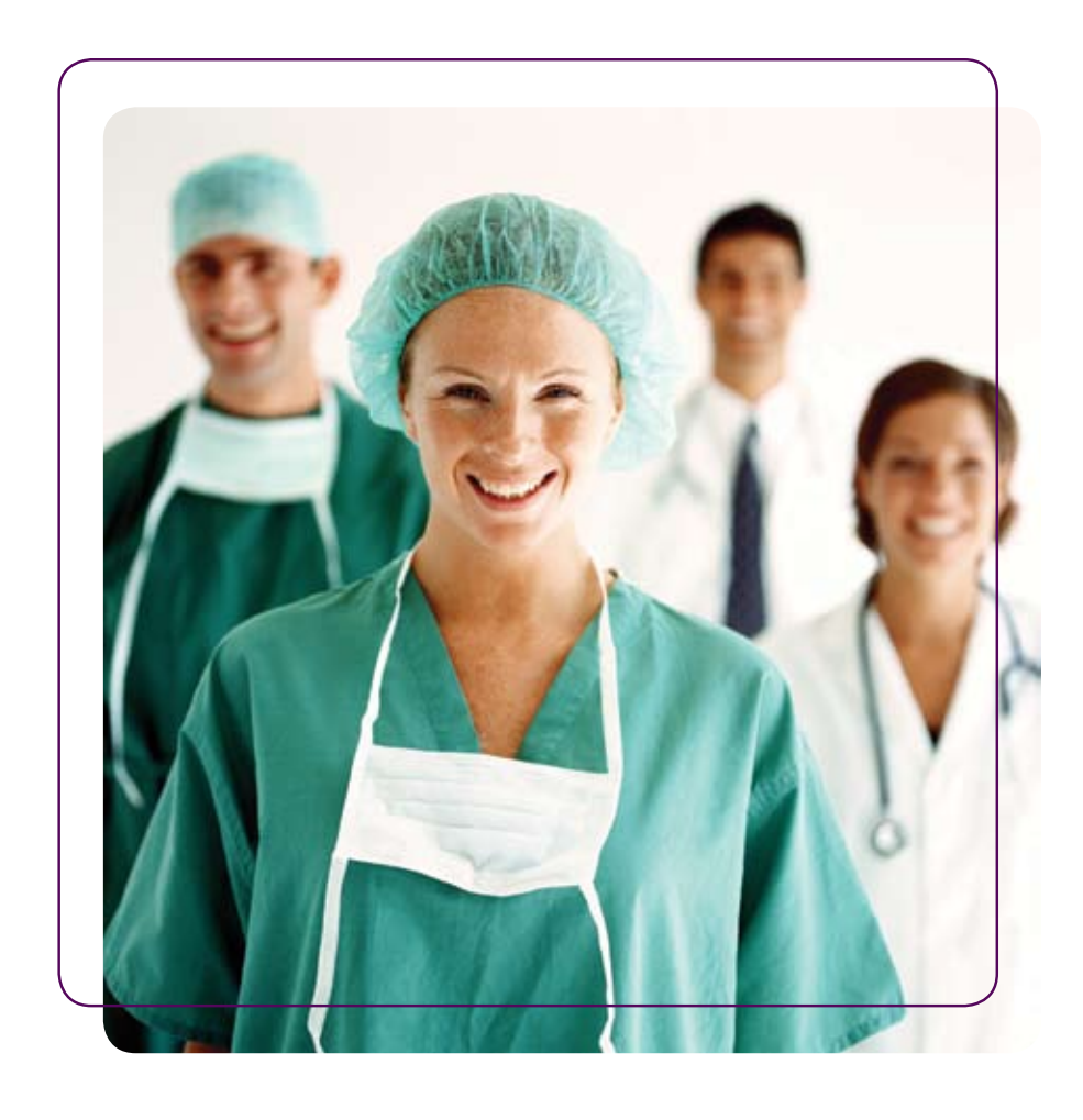
For more information on providing Best Doctors services to your plan members, please contact your benefits advisor or Great-West representative.